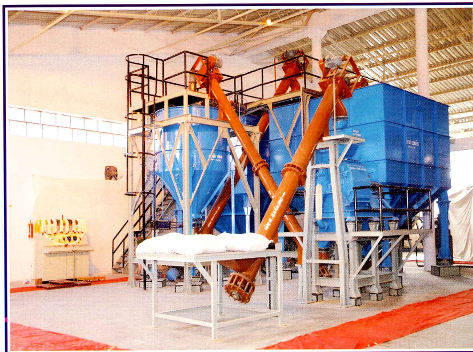
BYPASS PROTEIN SUPPLEMENT MANUFACTURING PLANT

Regionally available protein meals, like rapeseed meal, groundnut meal, sunflower meal, guar meal, soybean meal, cottonseed meal etc., are treated suitably, so as to reduce degradability of the proteins in the rumen from 60-70% to 25-30%, in a specially designed airtight plant. Protein meal identified for treatment is first ground to 3 mm particle size, treated chemically at appropriate level and then stored for 9 days under airtight conditions. After 9 days of incubation, protein meal is ready for feeding to animals and it can be even stored for more than a year, without any deterioration in quality. Treatment does not at all affect color, flavor or taste of protein meal/cake.