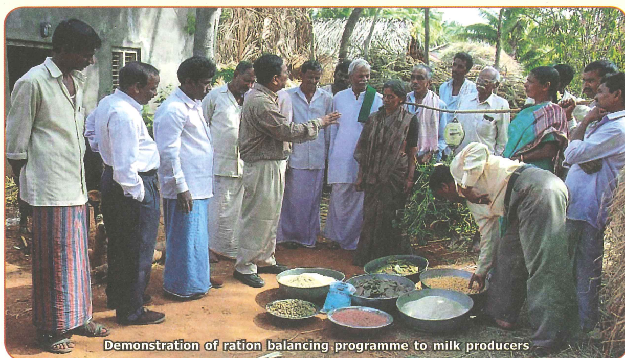
Demonstration of ration balancing programme to milk producers