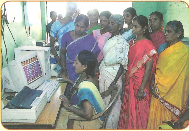
A technical officer explaining the concept of RBP to LRPs