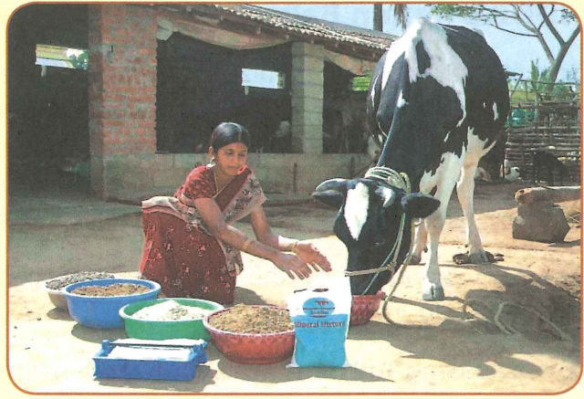
A milk producer feeding balanced ration to her cow

The local resource person (LRP) revisits the milk producer according to his/her requirement and keeps a record of the various observations related to the quality and quantity of milk, including the cost of milk production before and after implementation of the Ration Balancing Programme and increase in the net daily income per animal.