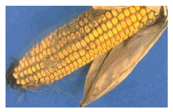
Figure 2: Maize naturally contaminated with Aspergillus fungus