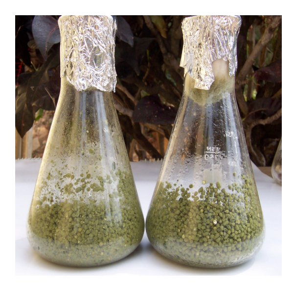
Figure 3: Growth of Aspergillus flavus on rice

Aflatoxins are primarily produced by fungi of the genus Aspergillus (Aspergillus flavus, Aspergillus parasiticus, and Aspergillus nomius ; Figure 3) and are found in dairy feed and human food products. Major forms of Aflatoxins found in feeds include Aflatoxins B1, B2, G1 and G2; with Aflatoxin B1 being the most common and toxic.