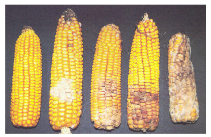
Figure 1: Maize cobs contaminated with Fusarium fungus

The threat of mycotoxins has been described as early as the Second World War when the soldiers from the Russian army suffered severe dermal necrosis, hemorrhages and destruction of bone marrow after eating mouldy grains ( Fusarium contaminated, Figure 1). However, it was not until 1960, when the entire turkey population of Britain was decimated in a fatal liver disease called ' Turkey X Disease ', that the scientific community recognized the negative effects associated with mycotoxins. British agriculture officials later traced the source of the outbreak to Aflatoxin in a shipment of peanut (groundnut) meal that originated from Brazil.