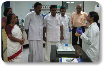
Visit to Microbiological Lab (at CALF)